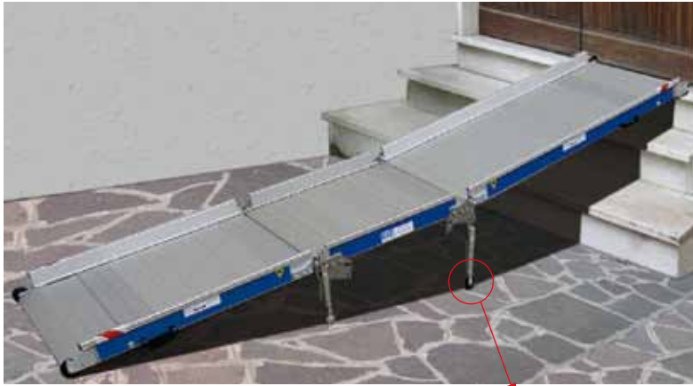
Equipped with WHEELS for quick and easy movements.

The mobile bridge ramp equipped with an undercarriage is the perfect solution for resolving temporary and occasional situations in which stairs or architectural barriers need to be overcome. Its practical wheels allow the unit to be easily moved or else locked in place. The unit is available in various lengths and its width can vary from 60 to 120 cm. A perfect multi-purpose solution for any temporary accessibility requirements at train stations, museums, churches and companies, as well as at the entrances to homes or other locations.